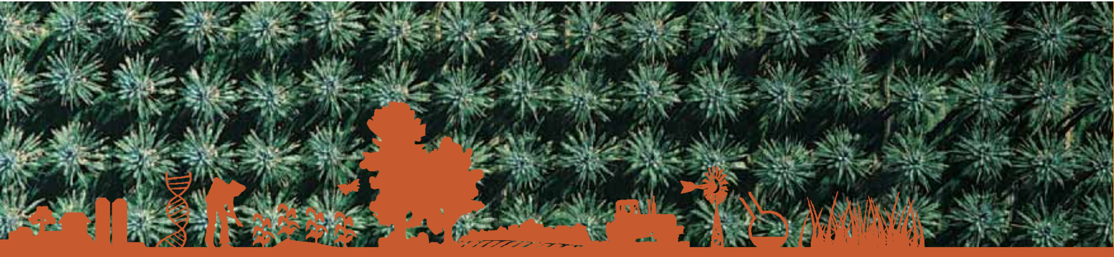
Annex 3 Quick Reference Guide of the Potential Minimum and Maximum Technical Requirements for the 4 Options Offered by SCBD