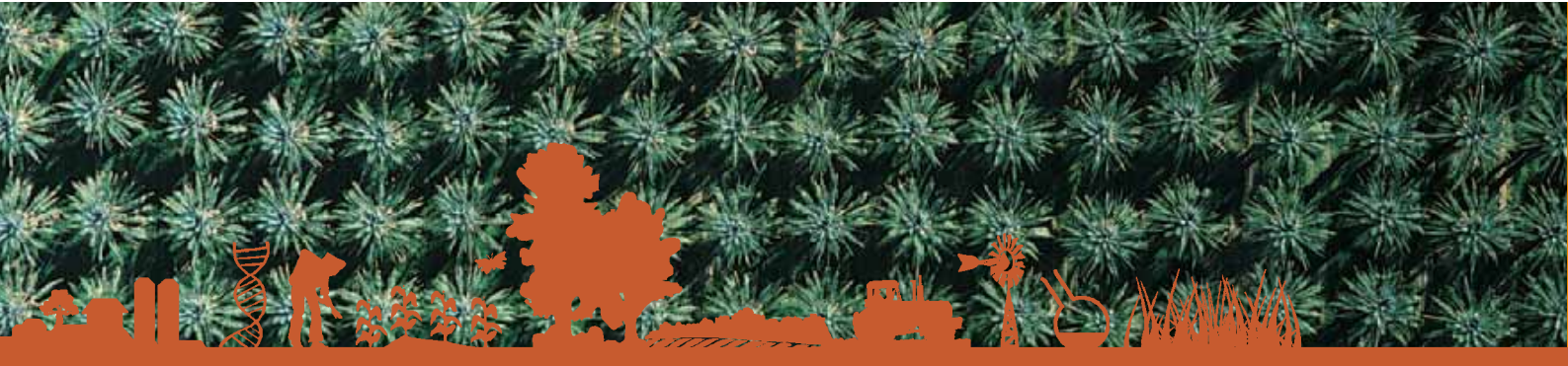
UNEP-GEF PROJECT FOR BUILDING CAPACITY FOR EFFECTIVE PARTICIPATION IN THE BIOSAFETY CLEARING-HOUSE OF THE CARTAGENA PROTOCOL

ting, and for other needs identified in the recommendations of the Intergovernmental Committee at its second meeting for assisting developing countries to prepare for the entry into force of the Protocol;"